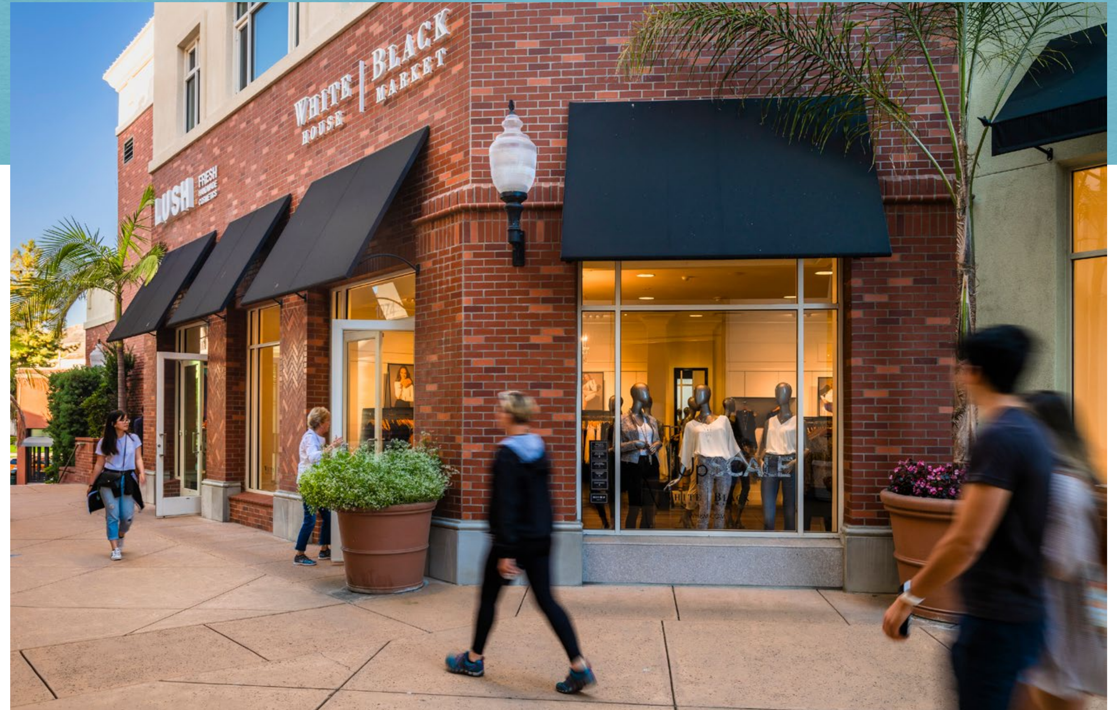
Located on a busy terrace that spans downtown San Luis Obispo's two most important retail streets, and adjacent to the SLO County Courthouse, in the center of the downtown retail, dining and entertainment corridor.