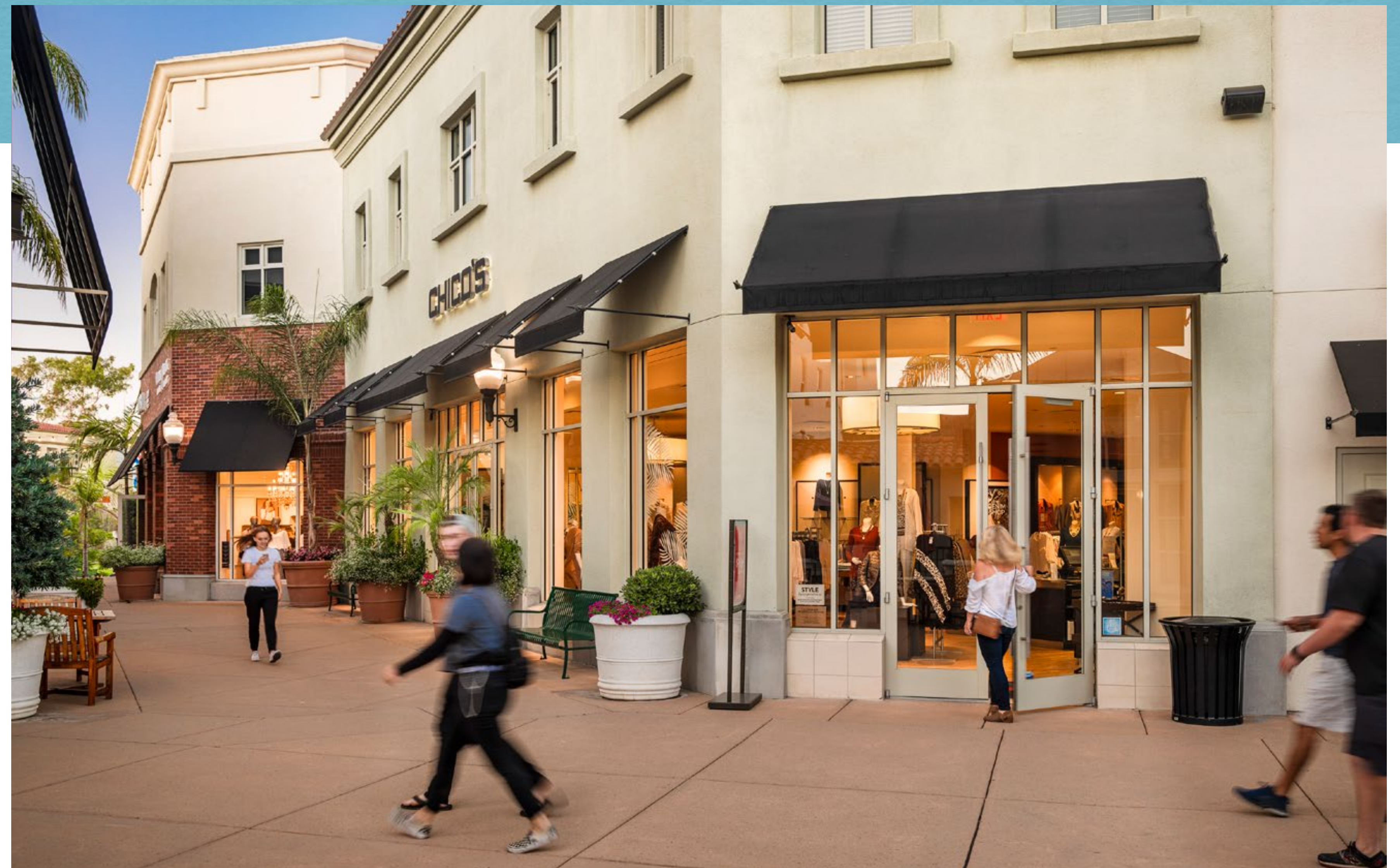
Located on a busy terrace that spans downtown San Luis Obispo's two most important retail streets, and adjacent to the SLO County Courthouse, in the center of the downtown retail, dining and entertainment corridor.