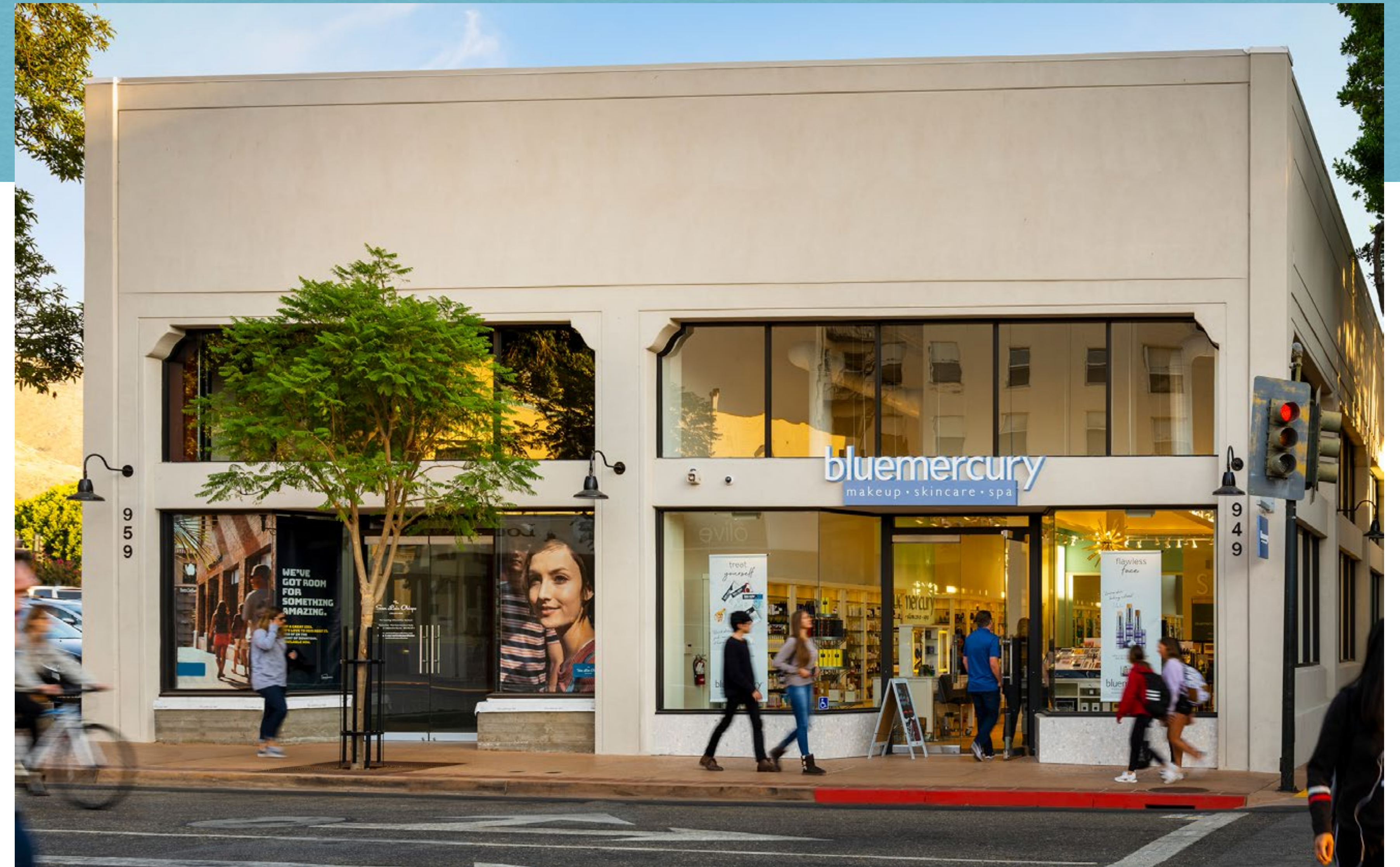
With a large number of working professionals, premium residential, and 5-star hotels located within walking distance, 959 Higuera Street represents an opportunity for a unique specialty retailer.